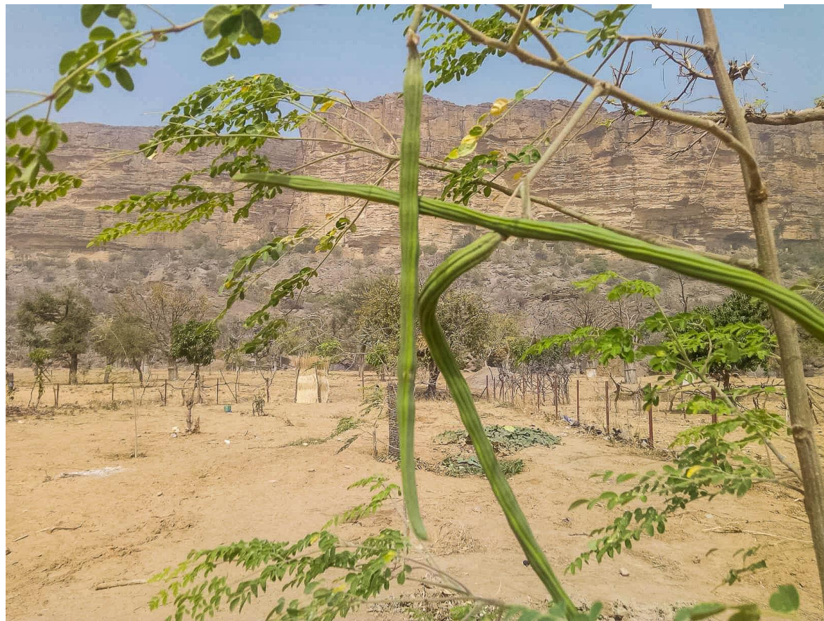
Moringa in the plantation to protect the village from the desert.

As in the previous years, the sheep-rearing activity that started FOD has been on hold due to the unrest, as it is too dangerous for most regional markets to operate anymore. The presence of livestock can also be dangerous for villagers with the prevalence of banditry throughout the conflict in the region, as animal stock are a prime target for bandits. Mere-odjou has the funds from the sold sheep waiting for the trade to restart, but we can only hope for a brighter future and the return of this income-generating trade.