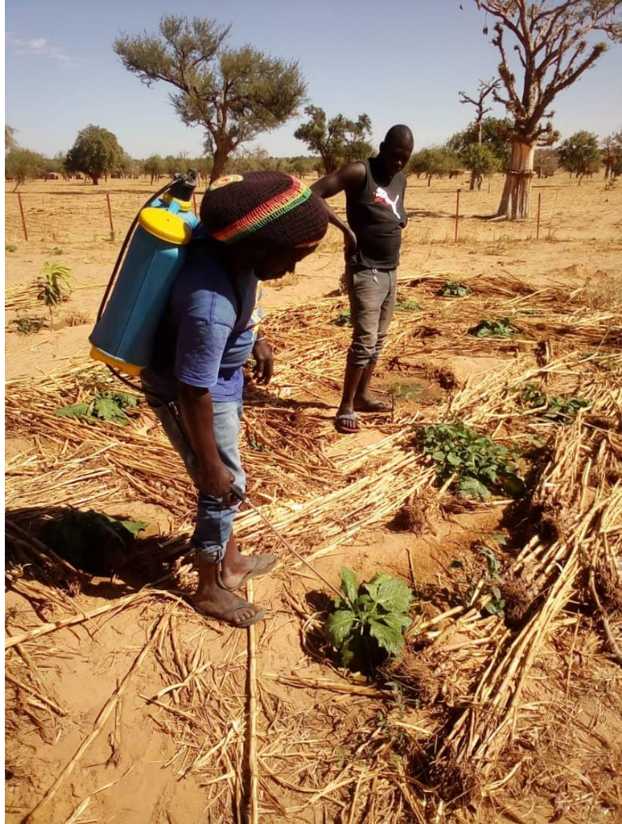
Applying biological insecticide produced in the village.

Mere-odjou and the villagers extended the school with another building during 2023 to allow better learning for the pupils. The work was done entirely locally with local materials for the bricks (cover page); no extra funding from FOD was needed. The extension underscores how the school with its canteen has become the centerpiece of progress and hope in Doundiourou.