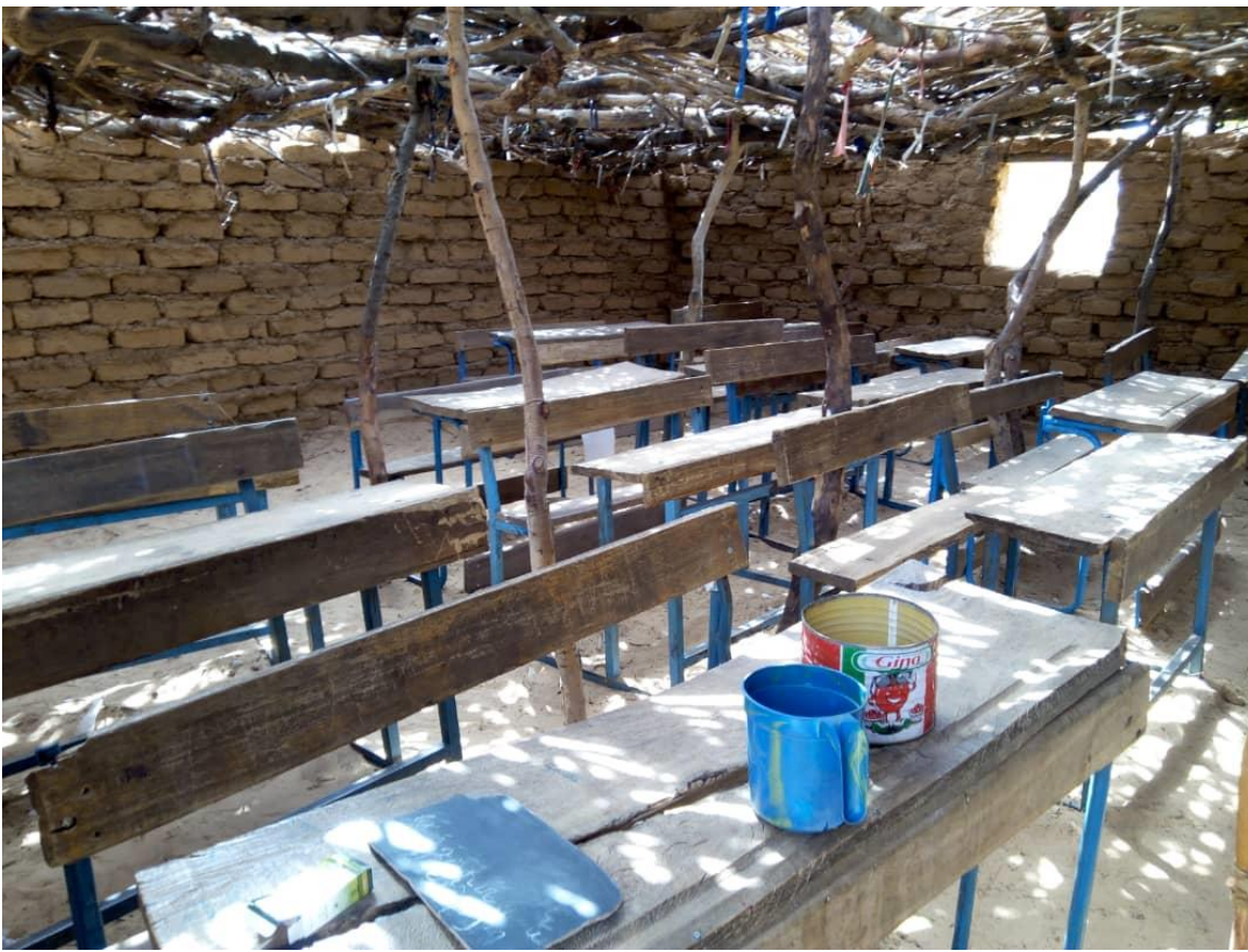
A second classroom built by the villagers in 2023.