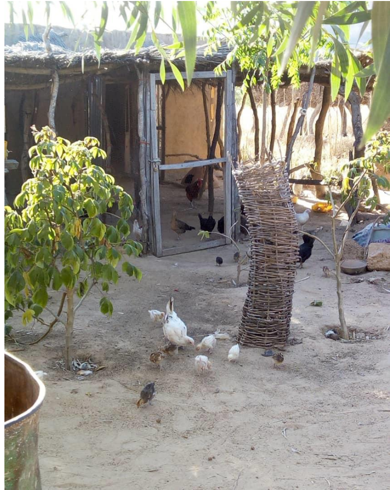
Upgraded chicken coop.