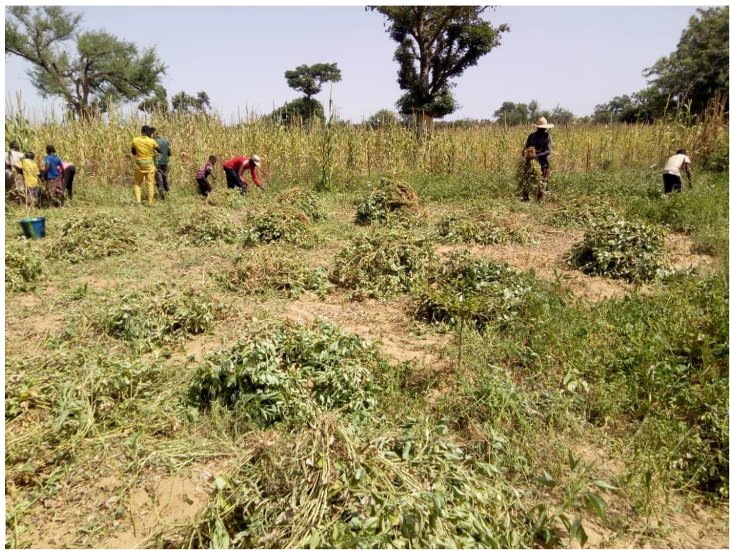
Villagers harvesting peanuts.