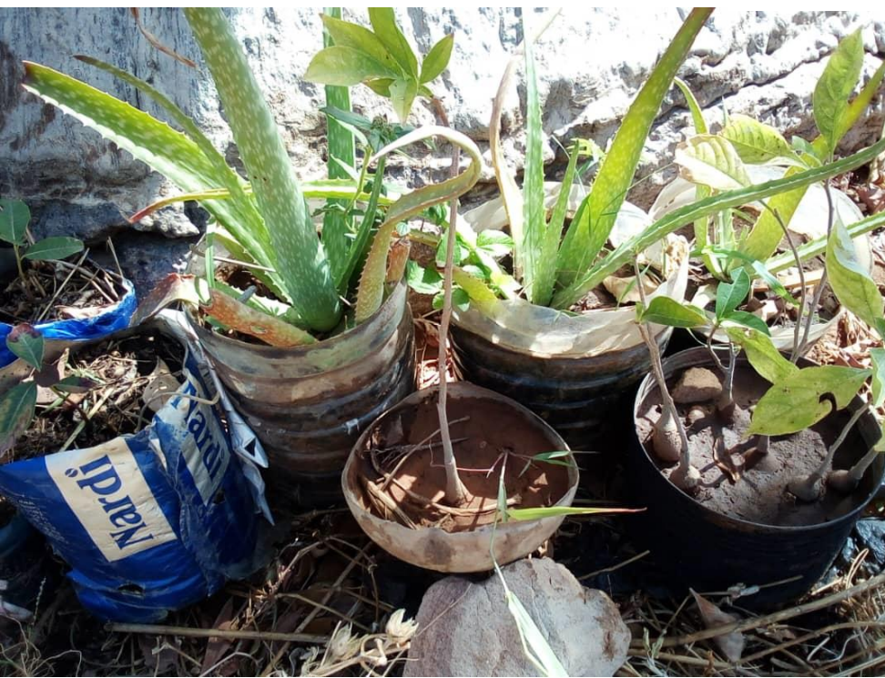
Bottom: Among other plants, the villagers have planted aloe vera for its medicinal properties.