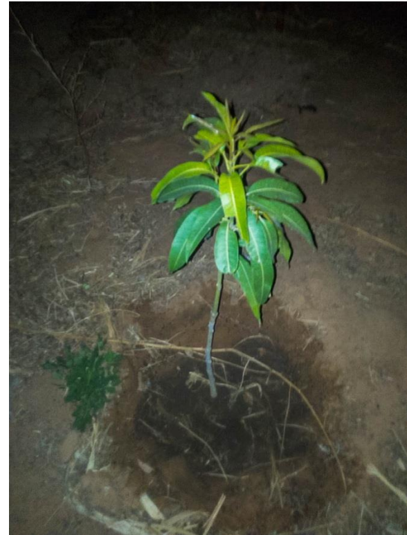
Top: Watering saplings at night to conserve water.

Our vision of a green Doundiourou, both in terms of vegetable raising as well as the green belt started in 2023, will require more regular water, Ha ha ha .This means that another well is needed. We are hoping that in 2024 we can move forward with this important goal of FOD that has so far been left in the shadow of more pressing needs in the village.