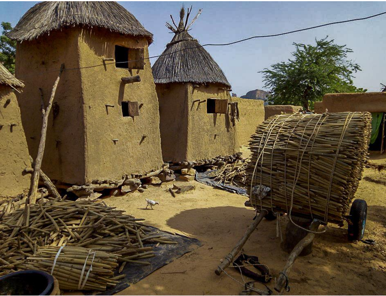
Doundiourou with Dogon huts.